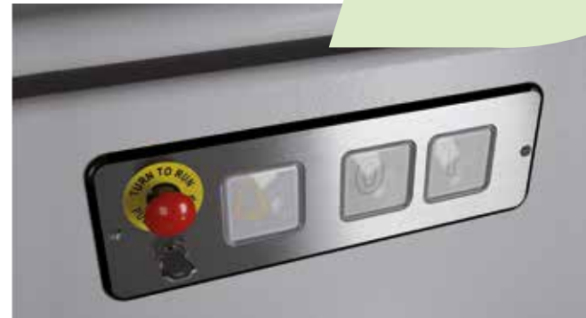
The on-board and floor control panels are equipped with keys and can be used easily.