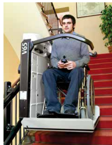
The V65 stairlift ensures comfort and safety over any kind of path